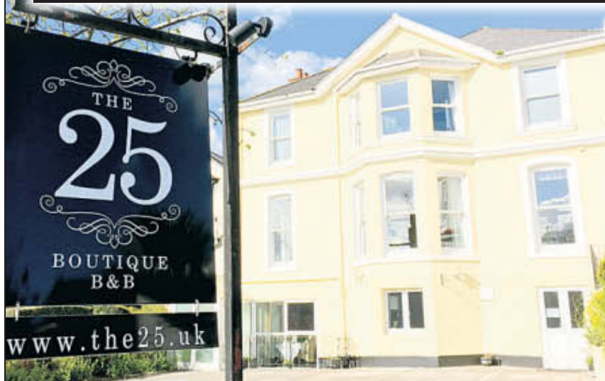
Grand design... The 25