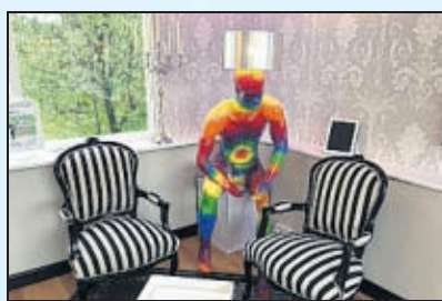
Art and soul... unique room decor