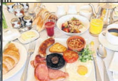
Frying high... guest's brekkie post