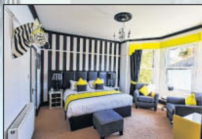
Earning its stripes... luxury room