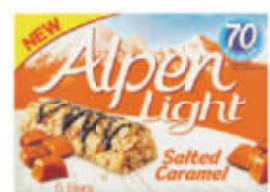
5 x 19g