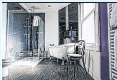
Suite sensation... plush bathroom