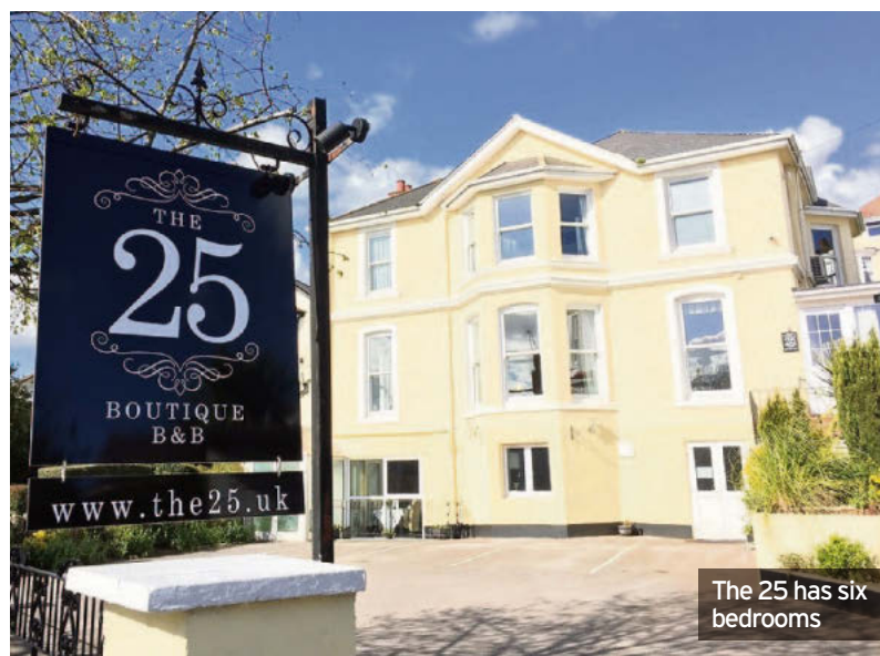
The 25 has six bedrooms

■ THE 25 can be found at 25 Avenue Road, Torquay, Devon, TQ2 5LB. Telephone: +44 (0)1803 297517. Prices start at £129 per room per night. Visit the25.uk/ for information.