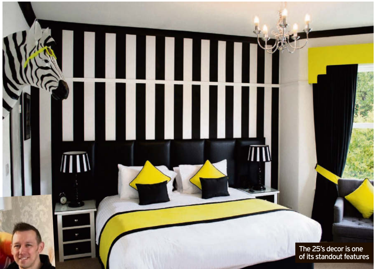
The 25's decor is one of its standout features

"Besides, as part of the next level of jobs I was looking at I had been psychometrically tested and they suggested various things to me that I would be good at. One was call centre manager, which I was already doing. Another was retail manager which I'd already done. Then there was recruitment manager which I'd