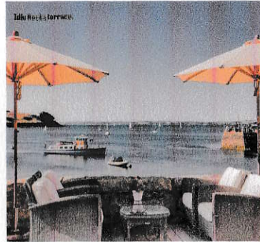
Idle Rocks terrace

Adults only The adults-only 25 Boutique B&B in Torquay, Devon has been named the 'Best B&B in the World' two years in a row by TripAdvisor. If finding "Frank" the zebra in citrus yellow sunglasses floats your boat, or the rainbow marigold light in reception is a bit, it's the place for you. It's just a 10-minute walk to the beach for a romantic stroll.