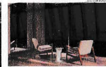
Left: The jacuzzi at Finn Lough, Inniskillen. Above: Enjoy the ultimate luxury package at The Londoner Hotel. Right: No need to wrap up in these Maldivian bubbles at Finlhu Baa Atoll.