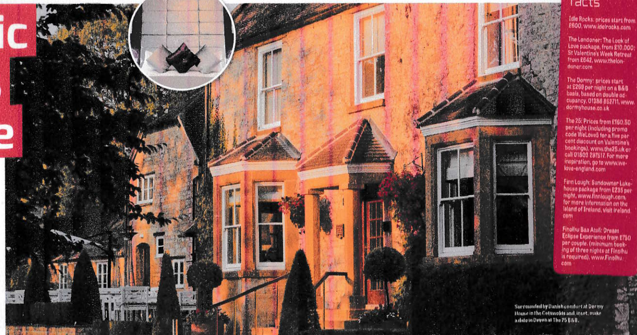
Surrounded by Danish comfort at Dorney House in the Cotswolds and inset, make a date in Devon at The 25 B&B.